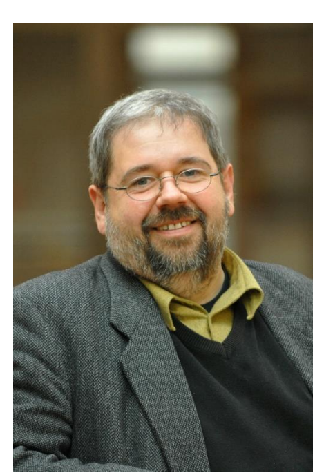
PROF. DR. WOLFGANG GEORG ARLT

FDI; Growth; Exchange rates; International trade; Outsourcing/off-shoring; International education; International tourism flows; The macro environment and macroeconomic policy